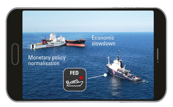
Carmignac

But that uninviting reality is being "augmented" – or at least mitigated – by what is objectively speaking a more placid environment than last year. Financial markets are now fully cognizant of the unfolding economic slowdown. And so are central bankers, who no longer feel required to stick to their script of unrelenting monetary policy tightening.